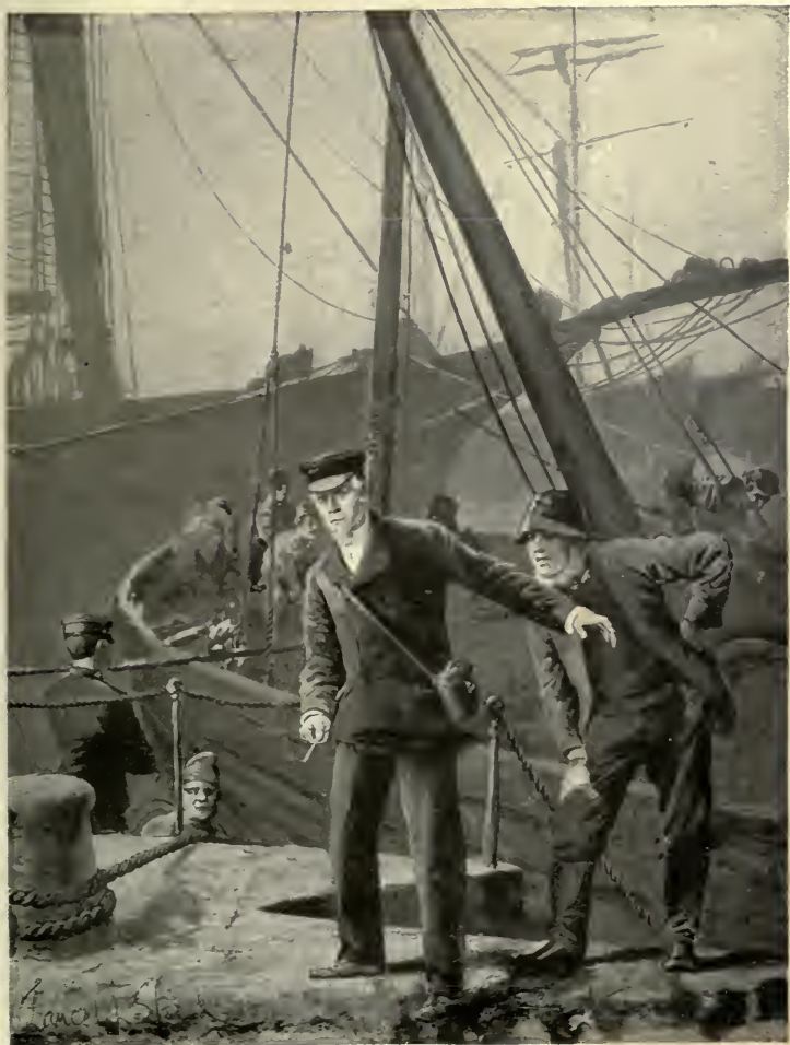
"WHAT HAS HAPPENED?"—Page 162.